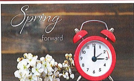
Sunday, March 13, 2022